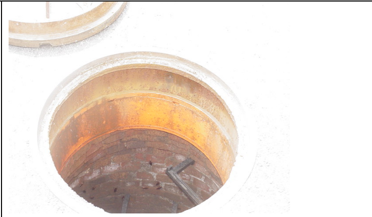
No buckling or compression setting or fatigue.