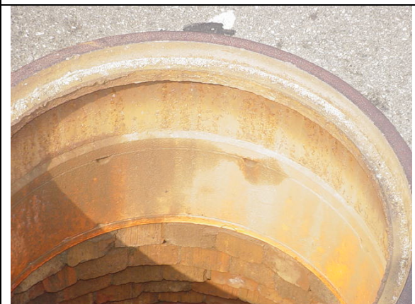
Inflow only from cover, notice the rust