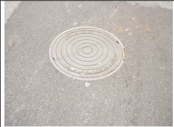
No deterioration of surrounding pavement.